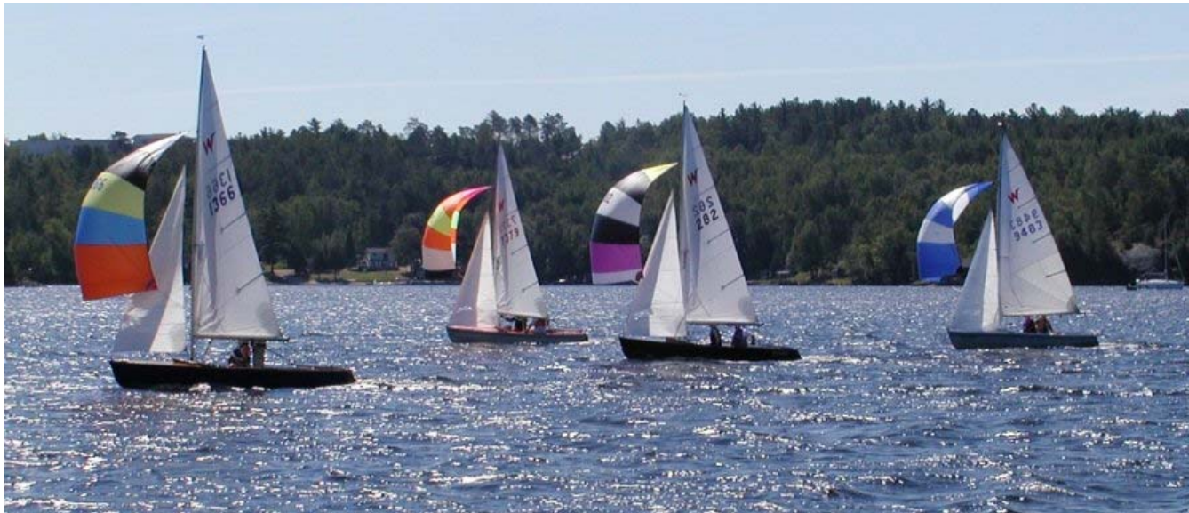
Sailing Callander Bay

FOR ADDITIONAL INFORMATION, PLEASE CONTACT DAVE OR CAROL HANSMAN dc.hansman@sympatico.ca telephone 705 495 4094